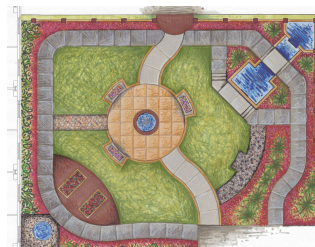
Patient Healing Garden Rendering