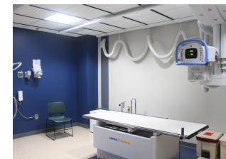
New X-Ray Equipment