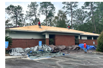
Construction on CCHD Roof